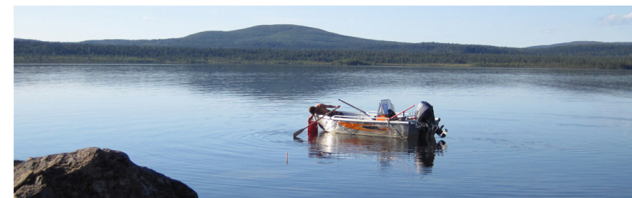
This publication has been produced with the assistance of the European Union, but the contents of this publication can in no way be taken to reflect the views of the European Union.